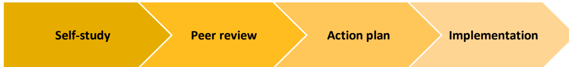
Figure: Phases of Academic Program Review

During a typical cycle, the self-study is written in the fall semester, with the action plan being finalized after a spring semester peer review. The typical cycle might be adjusted at the discretion of the provost and/or senior vice president for health sciences. Modifications to the self-study and peer review phases are an option for accredited programs, depending on the accreditor's requirements. Modifications are decided on a case-by-case basis.